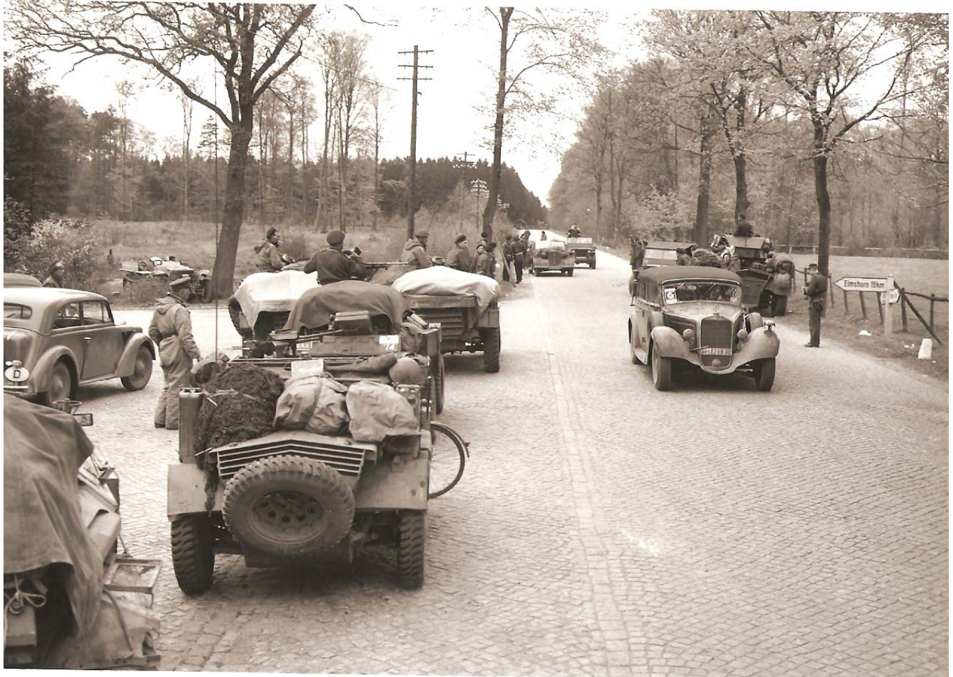
Image courtesy of the IWM BU 5229/NW Europe Photographer : War Office official photographer Description: After the meeting Gen Admiral Von Freideburg passing through our lines on the way to surrender. 4 th May 1945