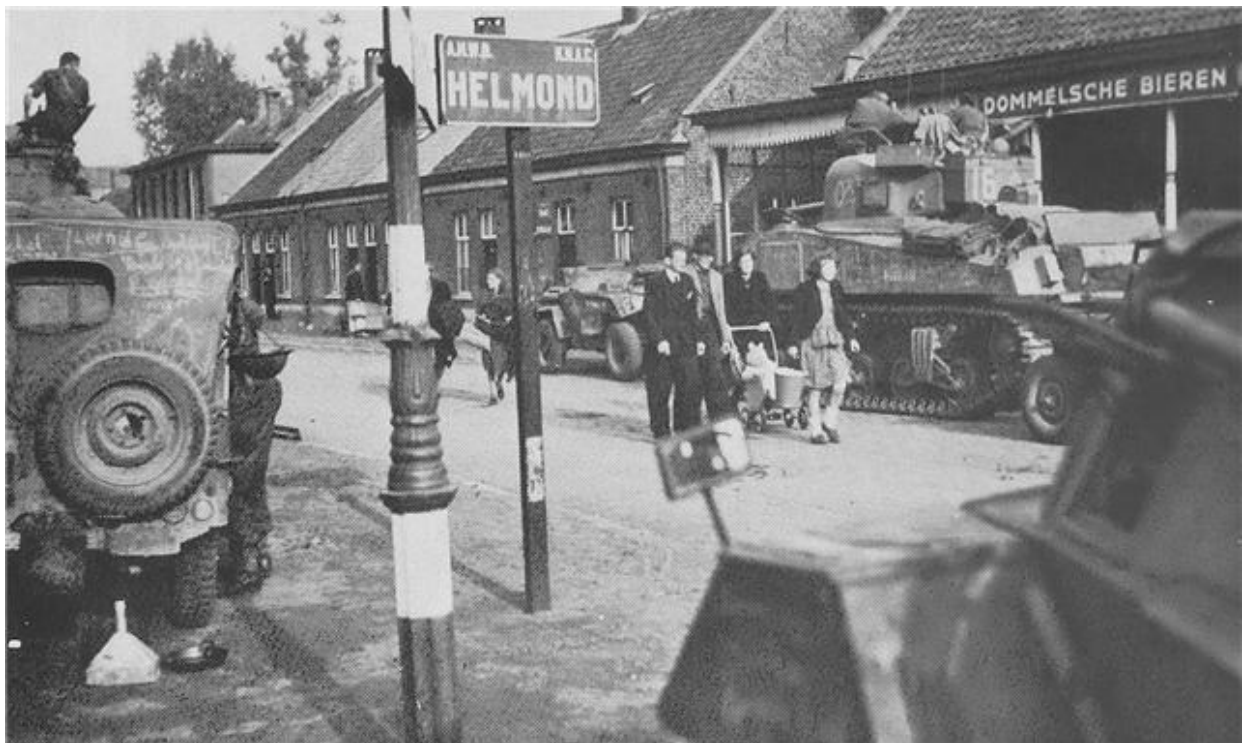
Description: 29th Armoured Brigade, 11th Armoured Div in Mierloseweg, Helmond. 22 Sept 1944