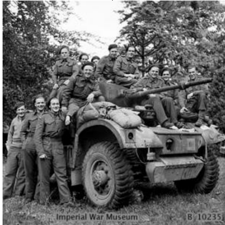
Images courtesy of the IWM DESCRIPTIONS & PHOTOGRAPHER: B10235, Mapham J (Sgt) No 5 Army Film & Photographic Unit, Daimler armoured car and crews of 1st Troop, 'C' Squadron, 11th Hussars, 22 September 1944