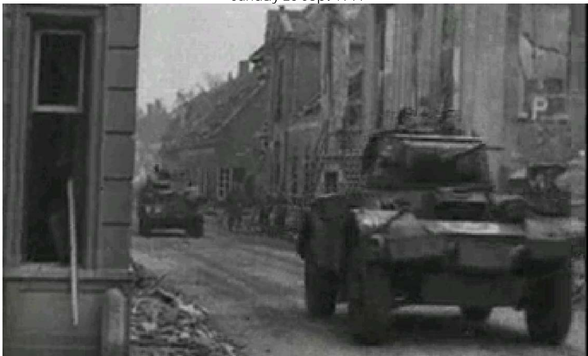
Description: Daimler armoured car in Hertogenbosch, Netherlands 29 October 1944