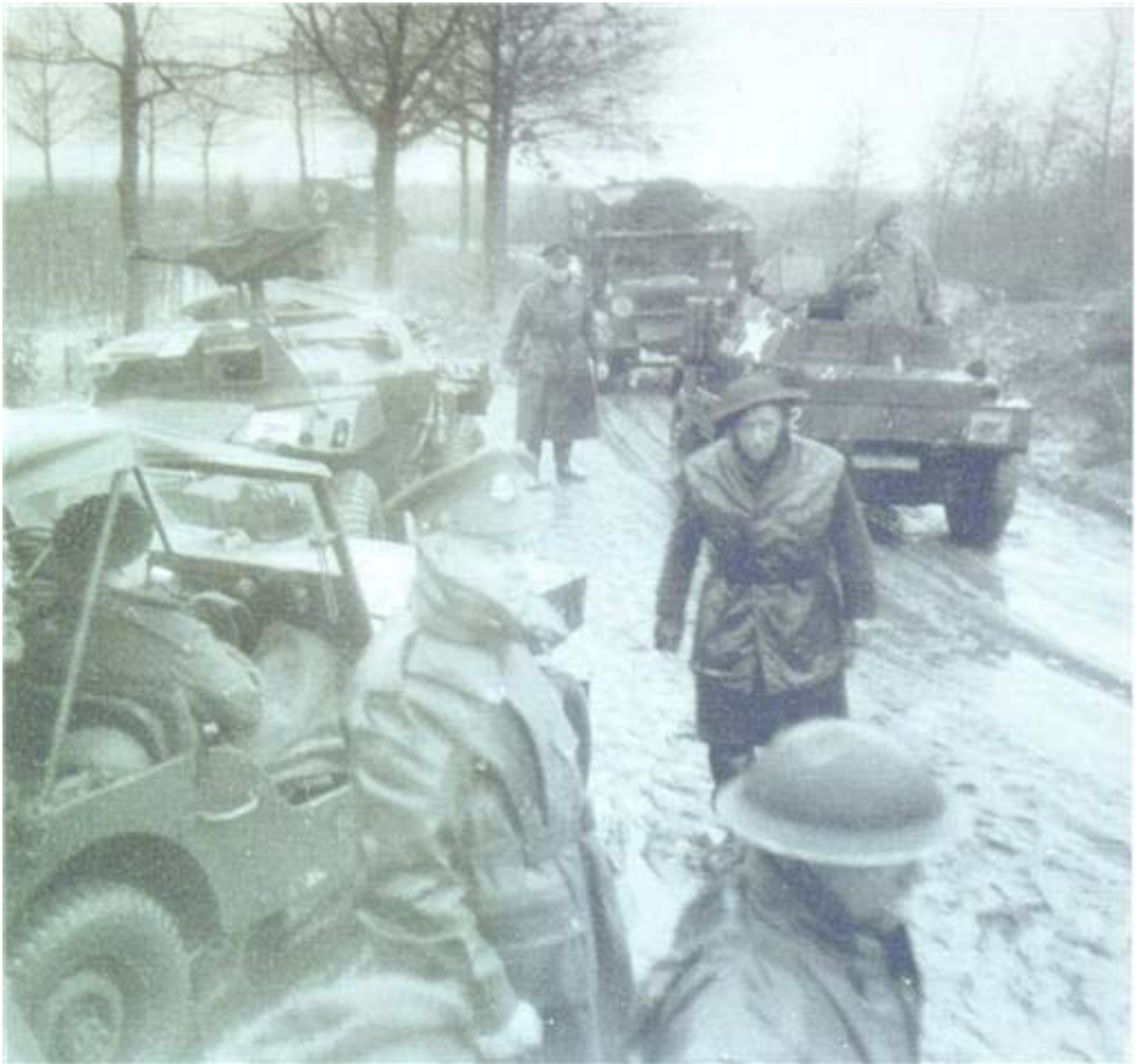
Description: (Possibly vehicles of 11th Armoured, Field Regiment Royal Artillery if the tac sign is 42. but this has not been verified)