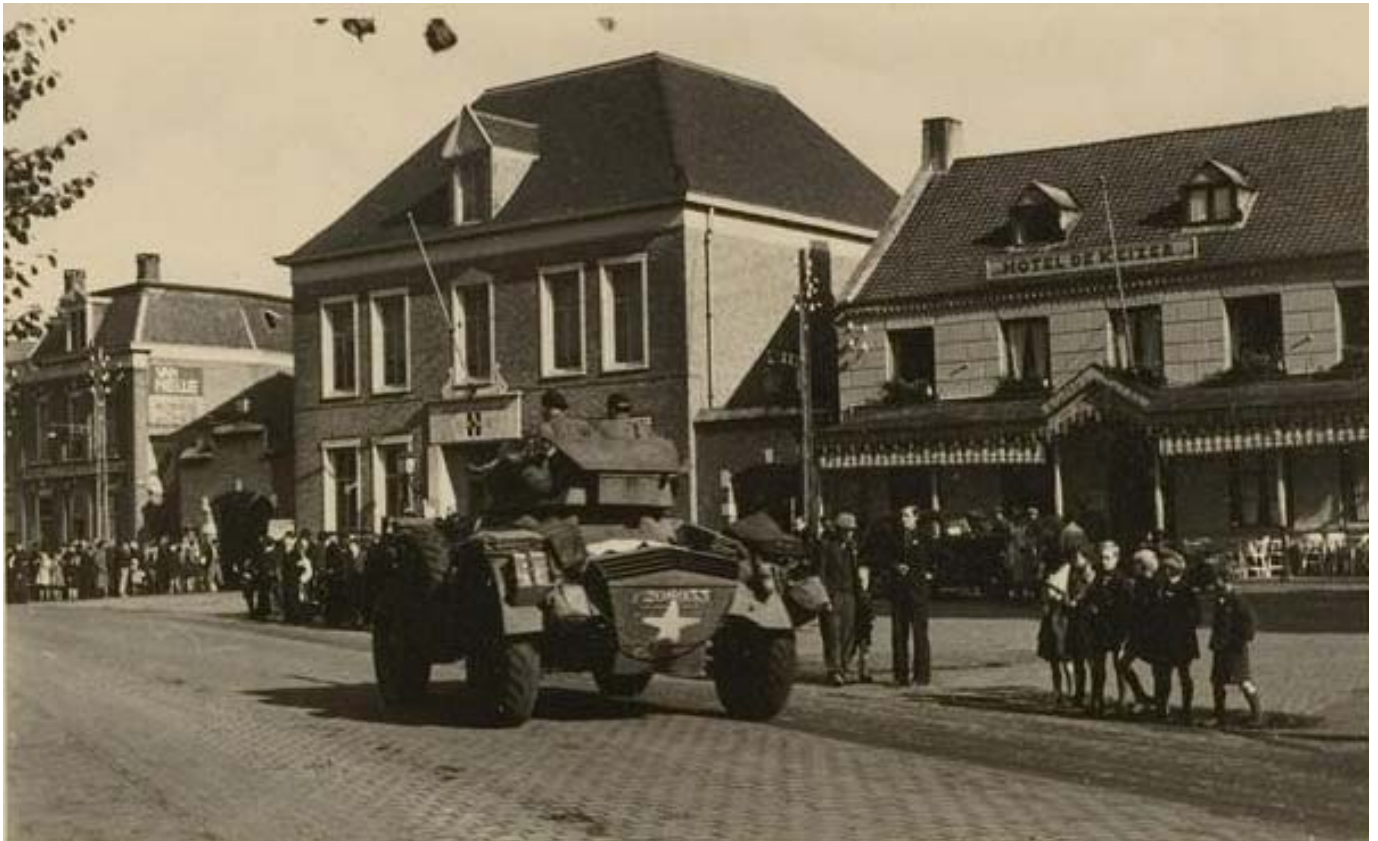
Image courtesy of Ferdinand Von Boomen Photographer: unidentified priest of the monastery of Gemert Description: The Nederland's. A DAC number F206033 proceeds through the town square of Gemert. Sunday 26 Sept 1944