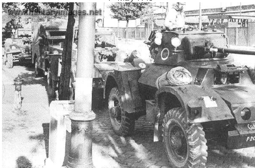
Description: Three Mark one DAC's and white scout car. Date: not known