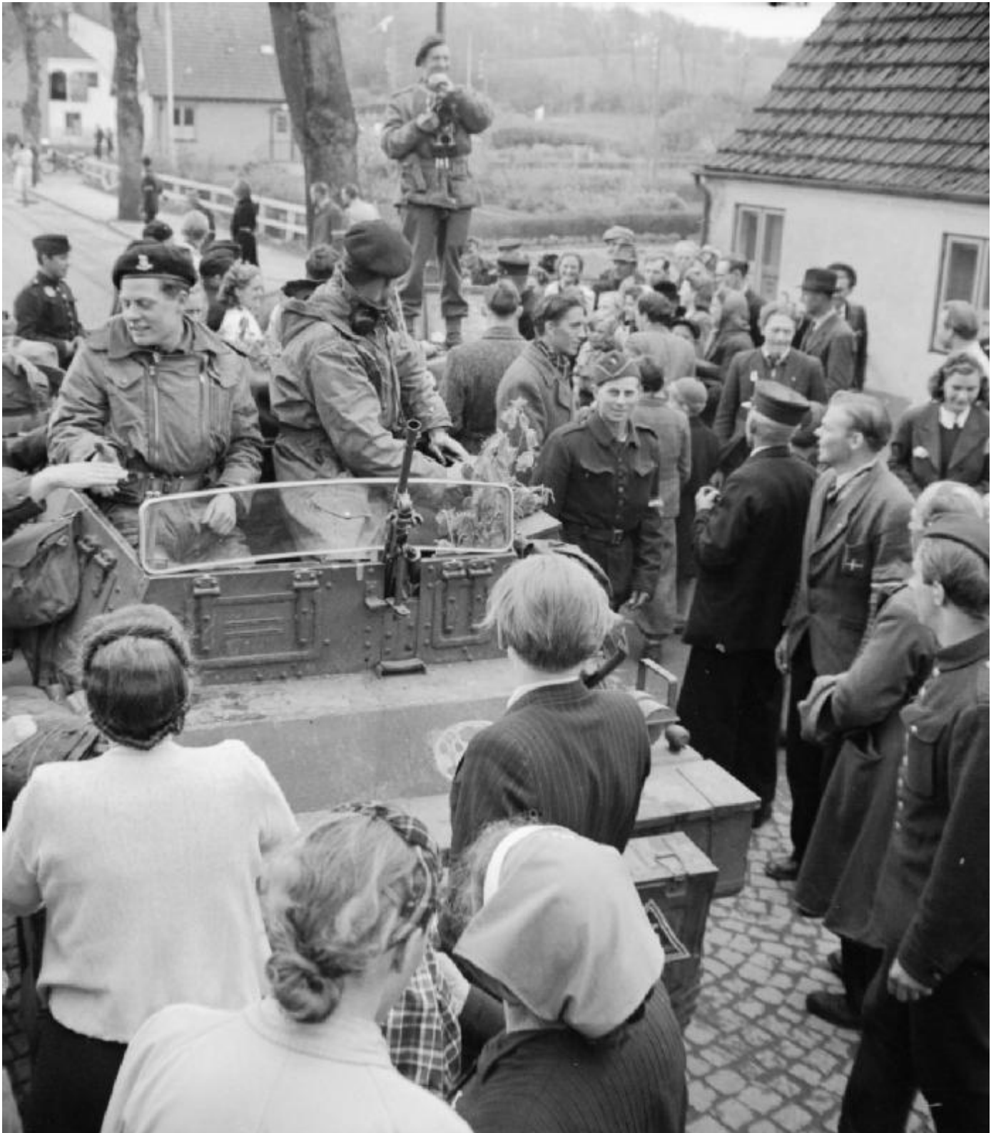
Reference BU5691