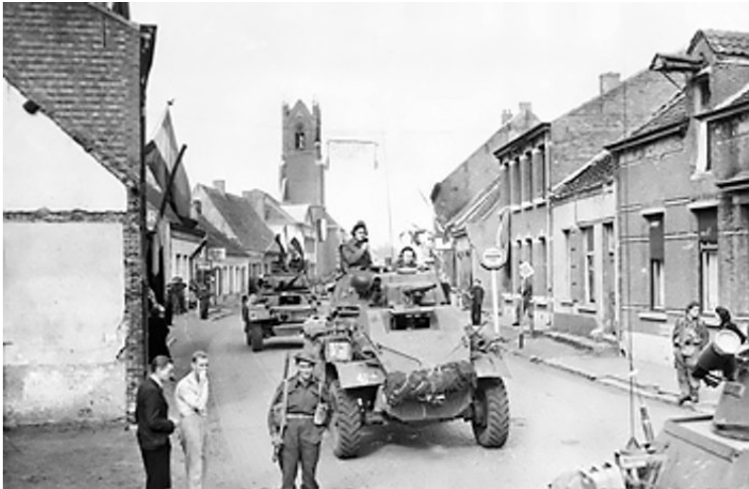
Image courtesy of the IWM 4700-05 BU 69103 & obtained from internet