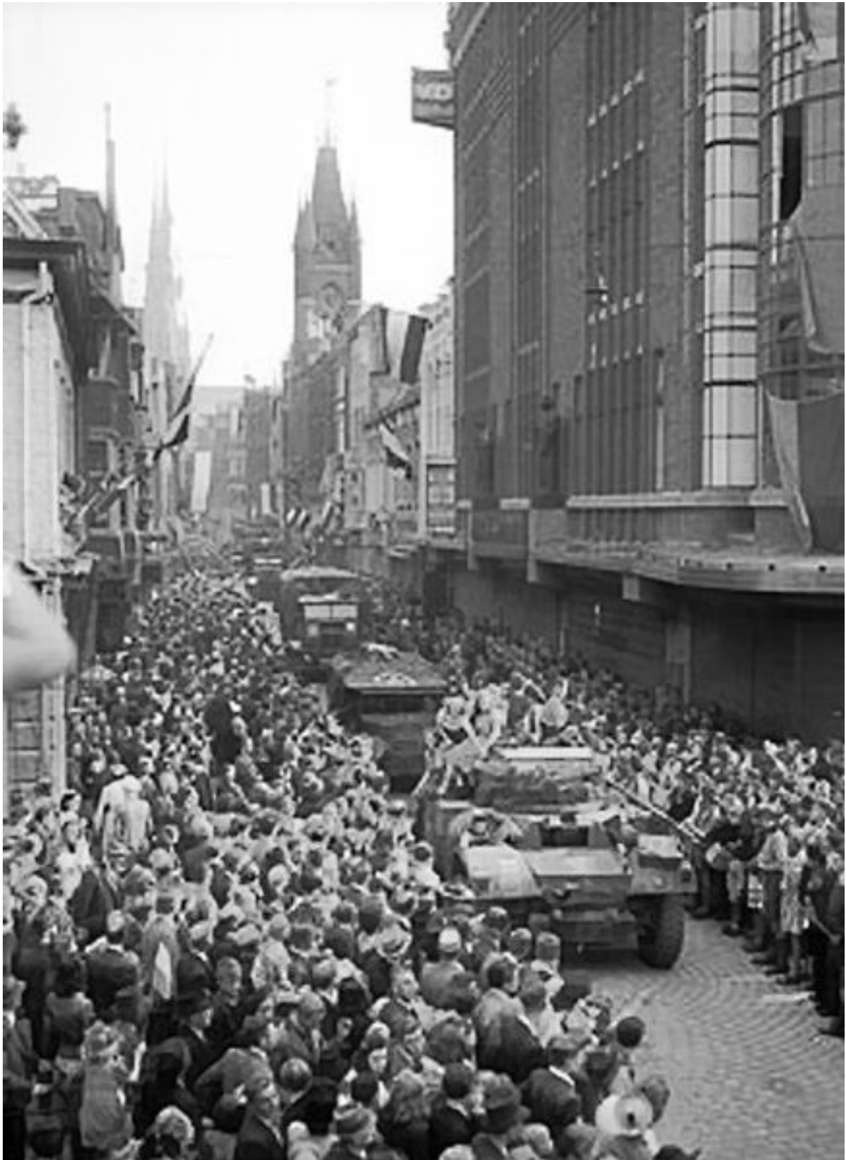
Description: DAC-Armoured car and trucks passing through Eindhoven Date 18 th September 1944