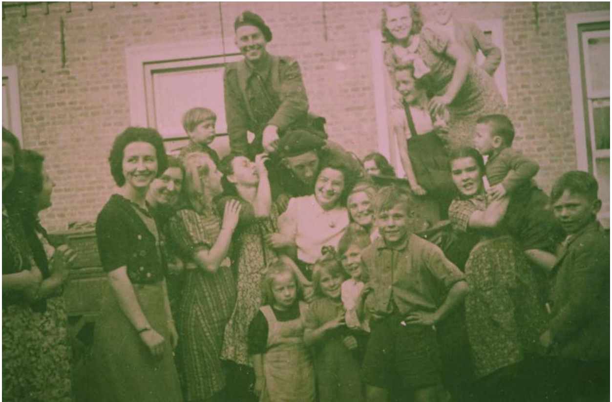
Description: First British soldiers during World War II to enter Angle Oeffelt, the Nederland's Circa: September 1944