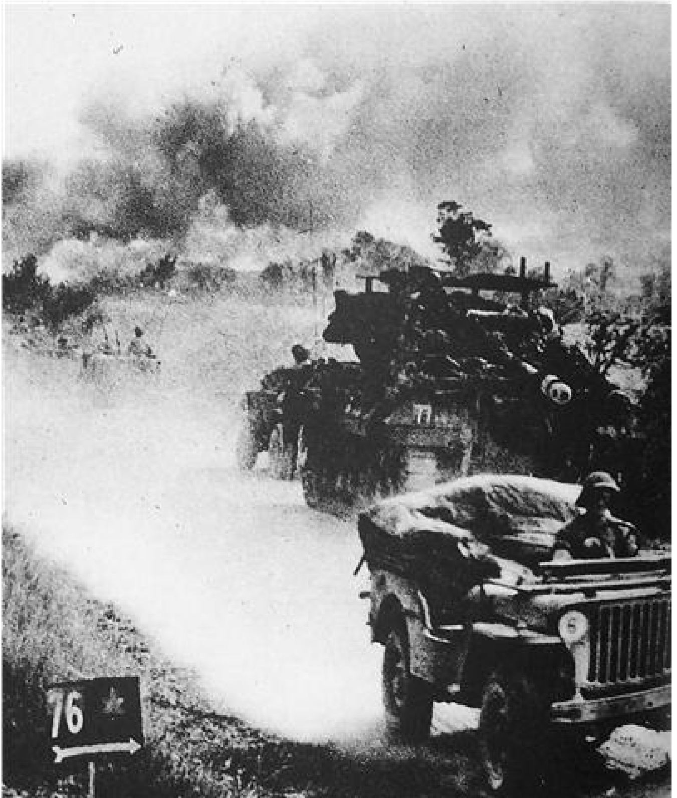
Description: Reputedly of the Faliase Gap, a dingo or possibly Humber scout car follows the Sherman Firefly. Circa 13 th August 1944