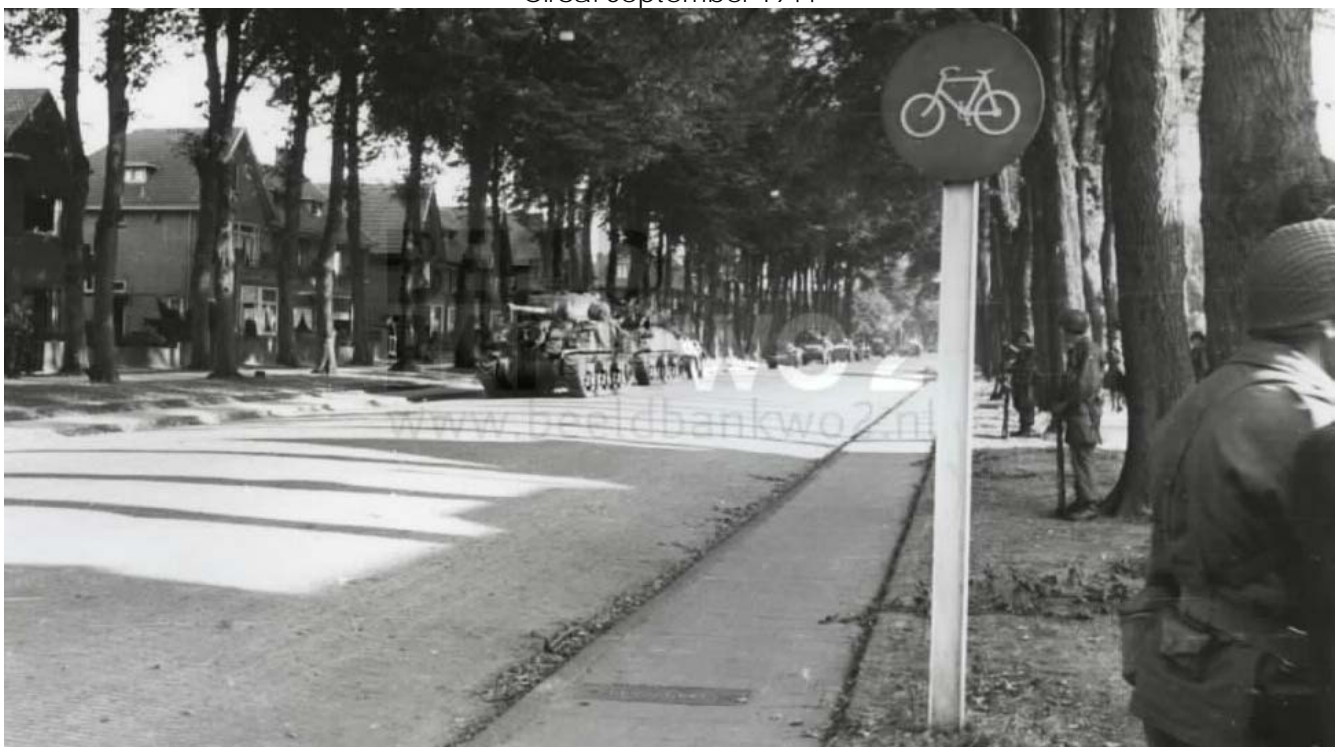
Description: Photo taken of the British march to U.S. bridges. Date: 19.09.44