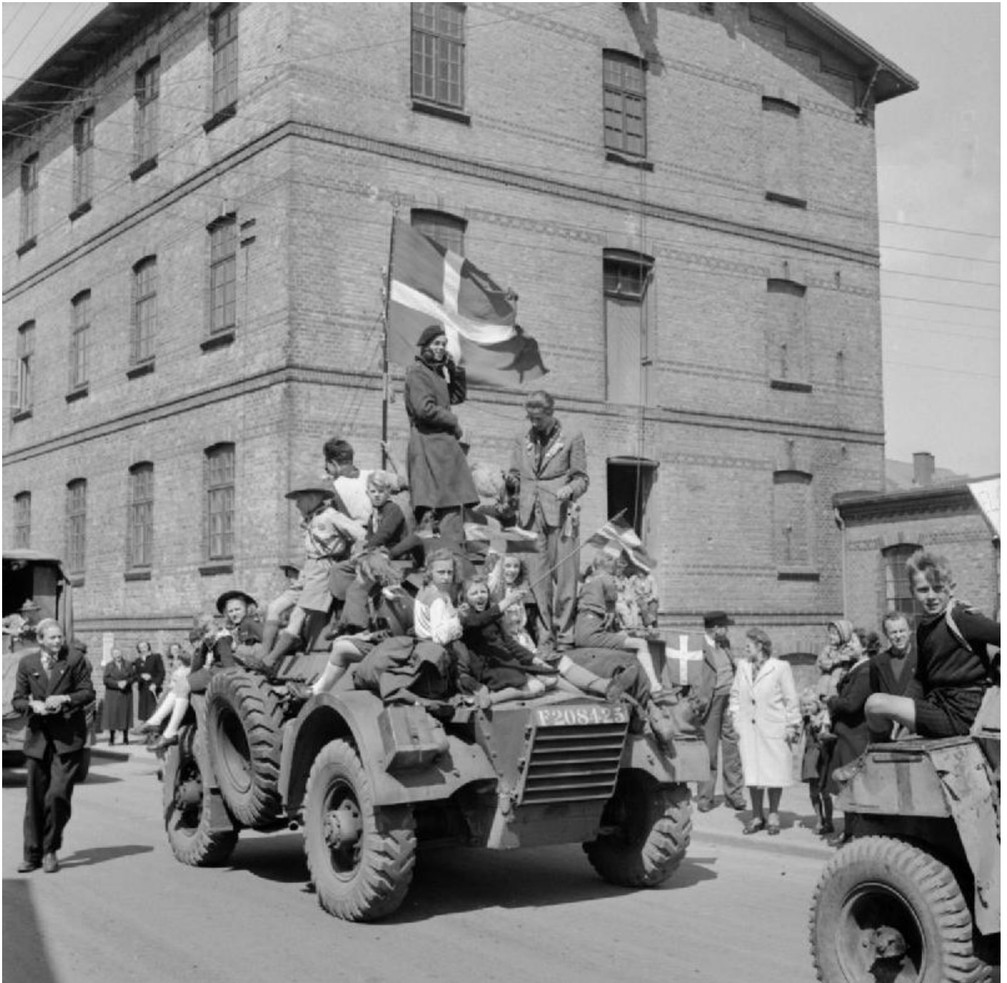
Civilians ride on a Daimler armoured car F208425 of the 1st Royal Dragoons as it enters the town of Hadersleben in Denmark. Date: 7 May 1945.